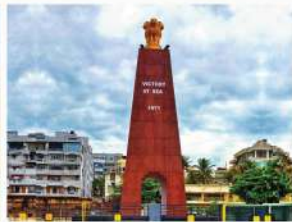
Victory at Sea War Memorial