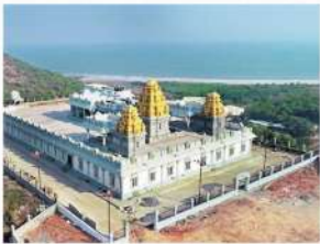
Sri Venkateswara Temple