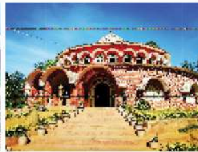
Araku Valley Tribal Museum