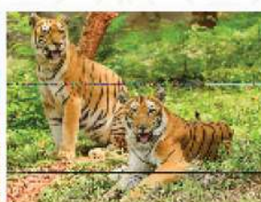
Indira Gandhi Zoological Park