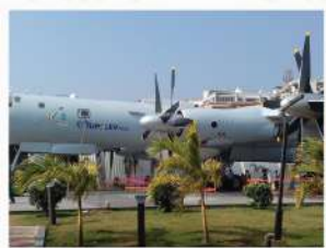
TU 142 Air Craft Museum

Visakhapatnam is a port city and industrial center in the Indian state of Andhra Pradesh, on the Bay of Bengal. It's known for its many beaches, including Ramakrishna Beach, home to a preserved submarine at the Kursura Submarine Museum. Nearby are the elaborate Kali Temple and the Visakha Museum, an old Dutch bungalow housing local maritime and historical exhibits. Hindu texts state that during the Fifth century BC, the Visakhapatnam region was part of Kalinga territory, which extended to the Godavari River.