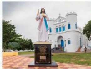
Ross Hill Church