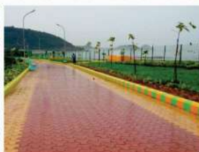
Lawson's Bay Beach